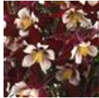
Burgundy And White