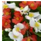
Red and White Mixture