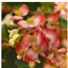
Bicolor Red White