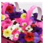
Formula Mixture Improved