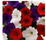
The Flag Mixture