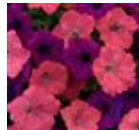
Opposites Attract Mixture