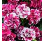
Rose And White