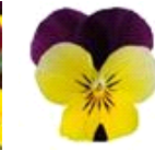
Yellow Jump Up