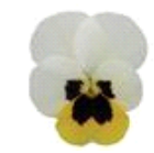
Lemon Ice Blotch