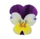
Lemon Jump Up