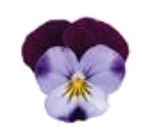
Denim Jump Up