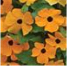
Orange with Eye