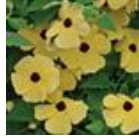
Yellow With Eye