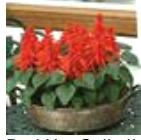
Red Hot Sally II