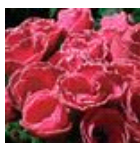
Rose with Edge