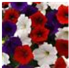
The Flag Mixture