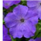
Lavender Sky Blue