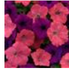
Opposites Attract Mixture