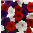
The Flag Mixture