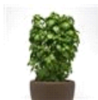
Everleaf Emerald Towers