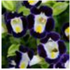
Blue & White