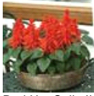
Red Hot Sally II