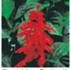
Red Hot Sally II