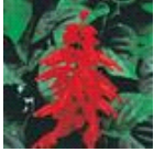
Red Hot Sally II