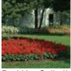
Red Hot Sally II