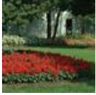
Red Hot Sally II