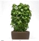
Everleaf Emerald Towers