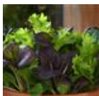
Pro Tatu Mixture