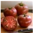
Heirloom Marriage Cherokee Carbon