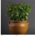
Sweet Dani Lemon