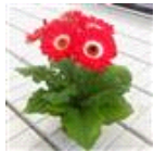
Bicolor Red White