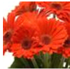
Deep Orange with Dark Eye