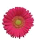
Bright Rose with Light Eye