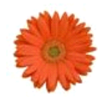
Orange with Light Eye