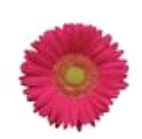
Bright Rose with Light Eye