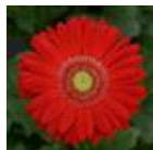
Red with Light Eye