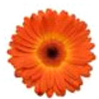
Bicolor Yellow Orange