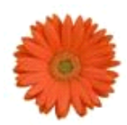
Orange with Light Eye