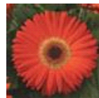
Deep Orange with Dark Eye