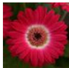
Bicolor Rose White