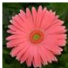
Salmon Shades with Light Eye