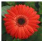
Red with Dark Eye