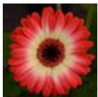
Bicolor Red Lemon