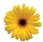
Golden Yellow with Dark Eye