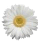
White with Light Eye