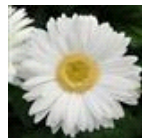
White with Light Eye