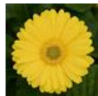
Yellow with Light Eye