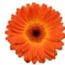
Bicolor Yellow Orange