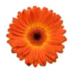
Bicolor Yellow Orange