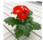
Orange with Light Eye Improved