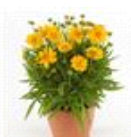
Double the Sun