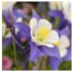
Blue And White