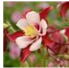
Red And White