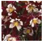
Burgundy And White