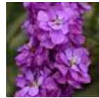
Miracle Blue Mid