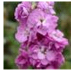
Ball Pink No 22