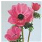
Orchid Shades Improved