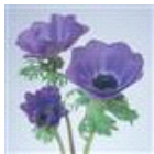
Deep Blue Improved