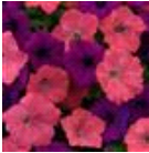
Opposites Attract Mixture