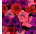
South Beach Mixture