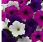
Great Lakes Mixture