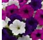
Great Lakes Mixture