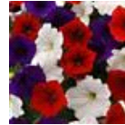
The Flag Mixture