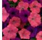
Opposites Attract Mixture