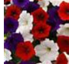
The Flag Mixture