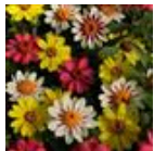
Raspberry Lemonade Mixture