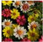
Raspberry Lemonade Mixture