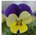
Lemon Jump Up