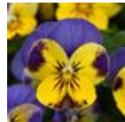
Yellow Blue Jump Up