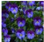
Blue Purple Jump Up