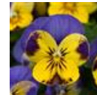
Yellow Blue Jump Up