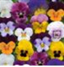
Spring Select Mixture