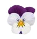
White Jump Up