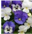
Blueberry Sundae Mixture