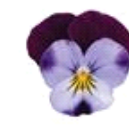
Denim Jump Up