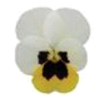
Lemon Ice Blotch