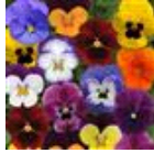
Autumn Select Mixture