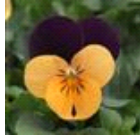
Orange Jump Up Improved