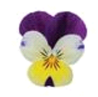
Lemon Jump Up