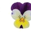
Lemon Jump Up