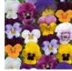
Spring Select Mixture