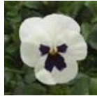
White Blotch Improved