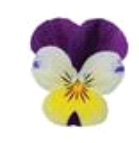
Lemon Jump Up