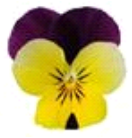
Yellow Jump Up