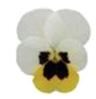
Lemon Ice Blotch