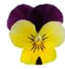
Yellow Jump Up