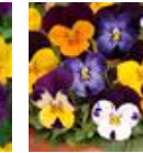
Jump Up Mixture