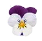
White Jump Up