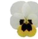
Lemon Ice Blotch