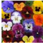
Autumn Select Mixture