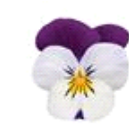
White Jump Up