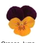
Orange Jump Up