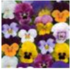
Spring Select Mixture