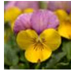
Yellow Pink Jump Up