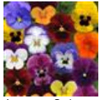
Autumn Select Mixture