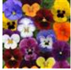
Autumn Select Mixture