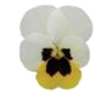
Lemon Ice Blotch