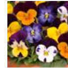
Jump Up Mixture