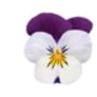
White Jump Up