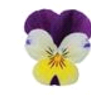
Lemon Jump Up