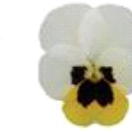
Lemon Ice Blotch