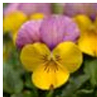
Yellow Pink Jump Up