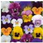
Spring Select Mixture