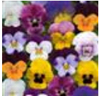
Spring Select Mixture