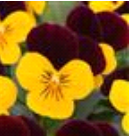
Yellow Burgundy Jump Up