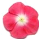
Cherry Red Halo