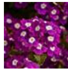
Violet with Eye