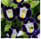
Blue & White