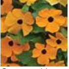
Orange with Eye