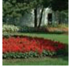
Red Hot Sally II