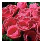
Rose with Edge