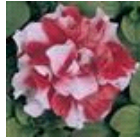
Red And White