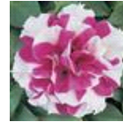
Rose And White