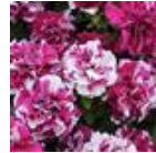
Rose And White