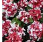
Red And White