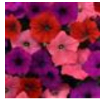
South Beach Mixture