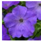
Lavender Sky Blue