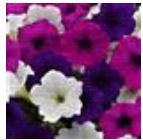
Great Lakes Mixture