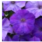
Lavender Sky Blue