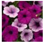
Plum Pudding Mixture