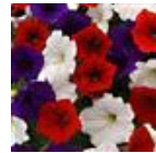
The Flag Mixture