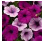
Plum Pudding Mixture