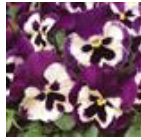
Purple & White