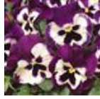
Purple & White